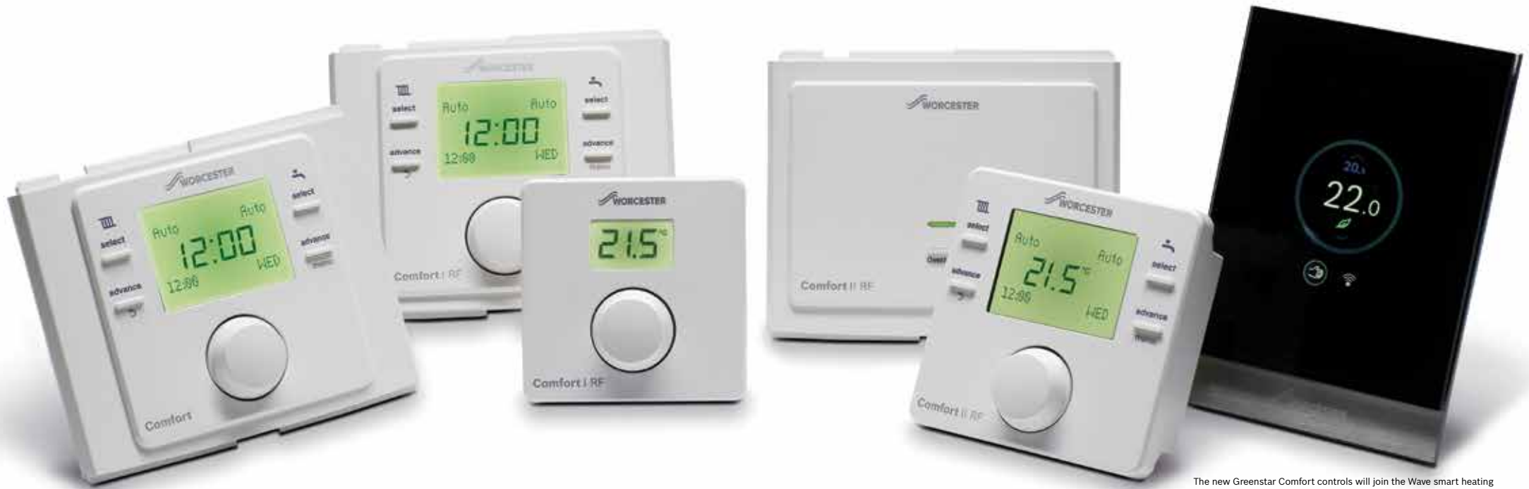
The new Greenstar Comfort controls will join the Wave smart heating controller which was launched earlier this year.