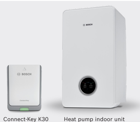
Heat pump indoor unit