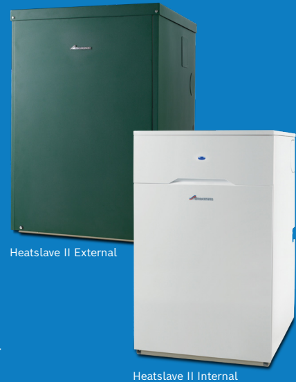
Heatslave II External

Frost protected High performance even in harsh weather conditions^